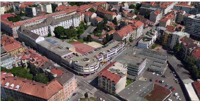
Enjoy advanced level-of-detail technology to ensure smooth navigation on city-scale scenes.