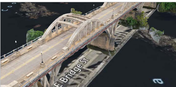
Review reality meshes in a web environment for visual checks.