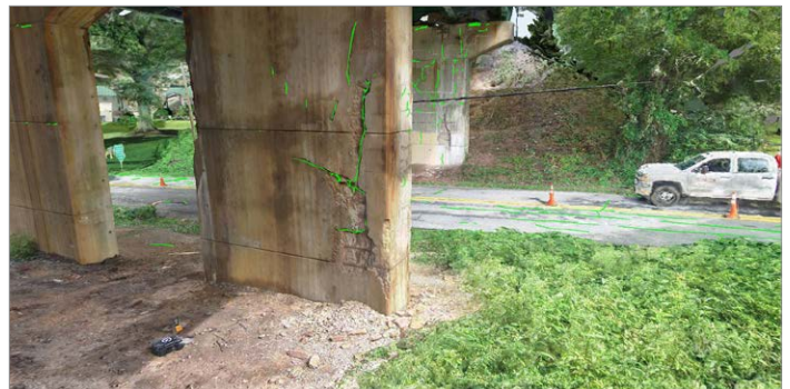
Leverage machine learning to automatically detect defects impacting infrastructure, such as cracks or spalling, to support inspection tasks.