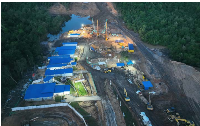
Waskita Karya relied on Bentley applications to create a connected digital ecosystem and generate digital twins for real-time cloud-based design reviews and construction simulation.