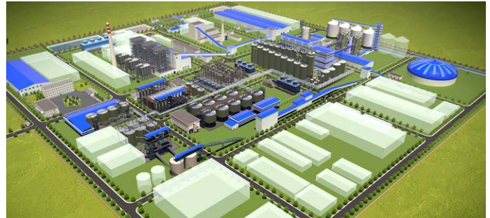
Integrating AssetWise with the digital twin, SAMI established the foundation for future visual smart factories in China’s aluminum industry.

Recognizing that the digital twin still required verification procedures and standards for control, they used Bentley software to develop visual and intelligent model verification and calibration processes, focusing on the rationality of equipment and pipeline layout, data integrity, safety, and operability. Implementing these processes enabled them to verify and resolve over 2,800 issues. “The Bentley software platform makes the quality of model verification specifications controllable and compliant with the standard requirements for subsequent deliveries,” said Liu. Using SYNCHRO 4D, they linked the digital twin with the construction plan to perform 4D construction simulation and scheduling. Bentley’s open integrated technology provided SAMI with the collaborative platform to establish standard workflows for creating digital twins and achieving digital deliverables for improved asset performance in China’s aluminum industry.